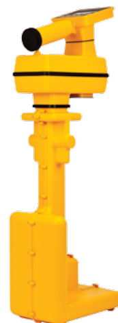
3M™ Dynatel™ iD Marker/EMS Tape Locator 7420