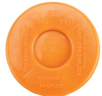
3M™ EMS Disk Marker Ideal for marking at shallow depths of 3–5'