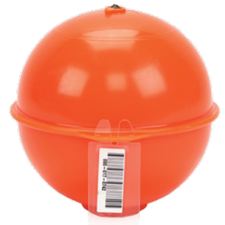
3M™ EMS Ball Marker Self leveling feature, suited for depths of 5–6'