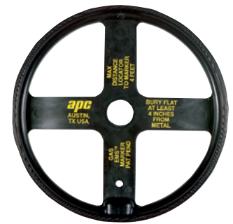
3M™ EMS Mini-Marker Designed for maintaining a stable position after placement at depths of 6'