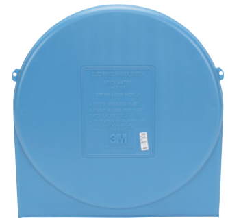
3M™ EMS Full Range Marker Suited for deep applications of up to 8–9'